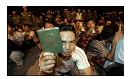
Fig.2 Migrant workers

- Social impacts such as crime and drug problems and numerous numbers of illegal migrants cause the competition on works among illegal migrants. Some of illegal migrants are