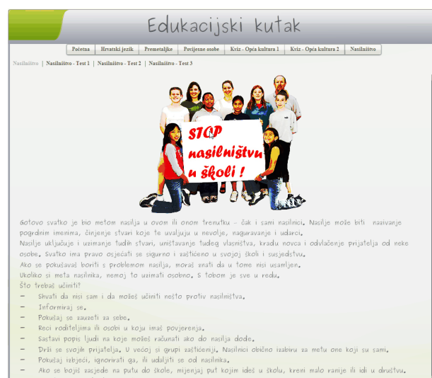
Fig. 3 Bullying prevention advice list.