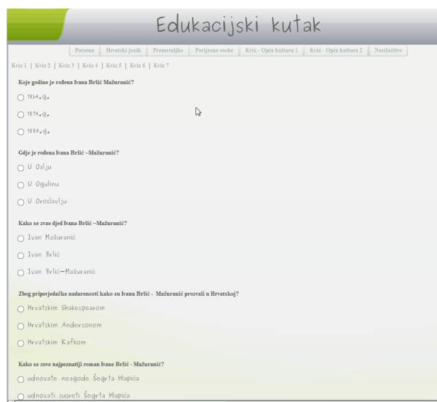
Fig. 1 Quiz on Croatian language designed with Purisa handwritten font.

Our students made the background theme colorful and attractive, since the educational corner should have appealed to the project target group – the primary school pupils.