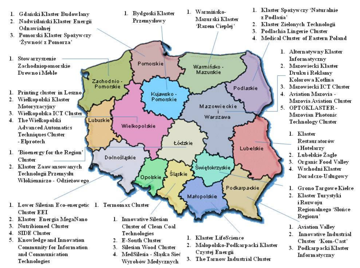
Fig. 2 sample group of Polish clusters according to the voivodships

As the main primary impulse for cluster establishment, cluster managers (from the sample group) pinpointed the companies' own interest and initiative (72%) – the bottom-up