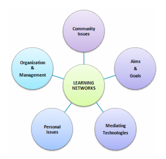
Fig 3: Crucial areas in networking process (Adapted by: Bottino, 2007) [14]

The evaluation of IBEM which helps hearing impaired individuals use the portable information and communication technologies effectively and consciously, and aims at providing them with learning environments and communication opportunities enriched with these technologies is covered in four dimensions.