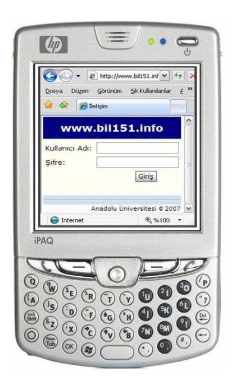
Fig.3 PDSs as an assistive technology for İBEM