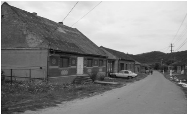
Fig. 3 Traditional rural landscape in Sasca Română village (Olaru, 2010)

e. We can estimate that signs and advertising are generally poor. Information available on the internet is not updated, being restricted to the most popular areas. Only one rural community has now a tourist information center, and signposts are present only locally (Fig. 10).