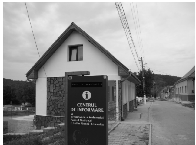
Fig. 8 Tourist information center (Sasca Română, Olaru, 2009)

Semi structured interviews (of the life story type) have focused on finding out the story of each landlord in order to identify elements with a high degree of generality, as well as those that are highly exceptional, particular.