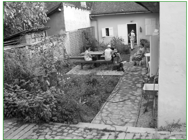
Fig. 7 Courtyard and terrace (Pension Dora, Sasca Montană, Olaru 2009)