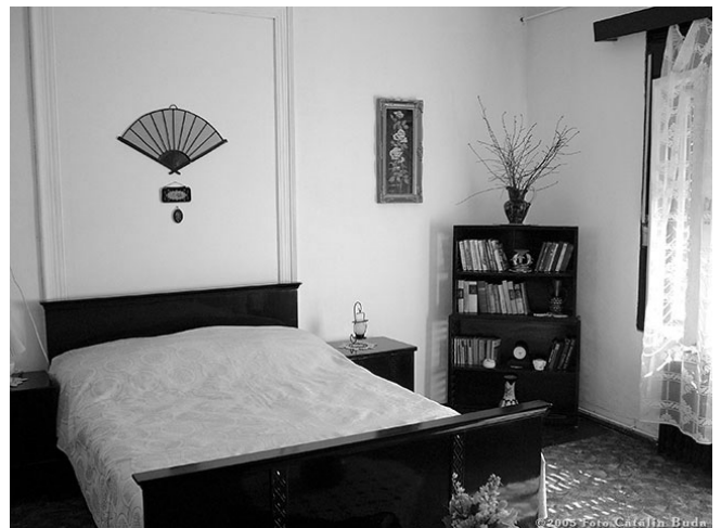
Fig.6 Modern furniture and interior design inside the rural pension (Pension Dora, Sasca Montană; Olaru, 2009)