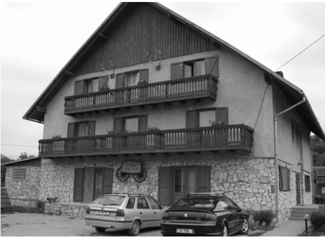
Fig. 6 Rural pension in a neutral style (Nera Land, Sasca Montană, Olaru, 2009)