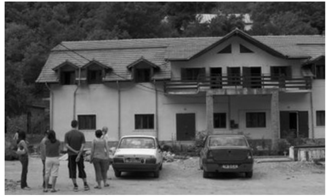
Fig. 4 Agathos Pension, Sasca Montană (Olaru, 2009)