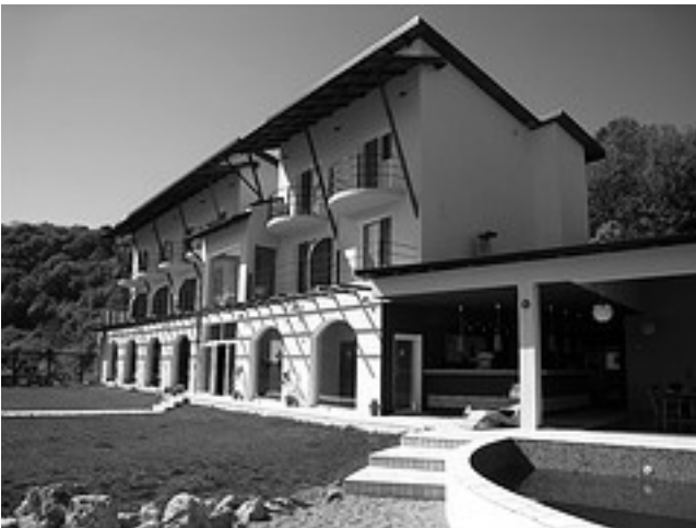
Fig. 8 Recent rural pension, on the Danube (Pension September, Ieșelnița)