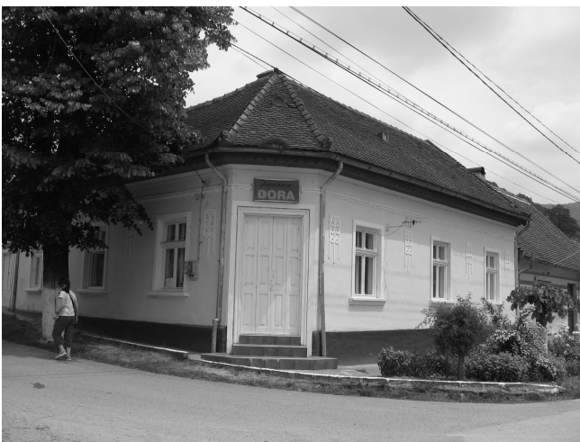
Fig. 5 Former house transformed in rural pension (Sasca Montană; Olaru, 2009)