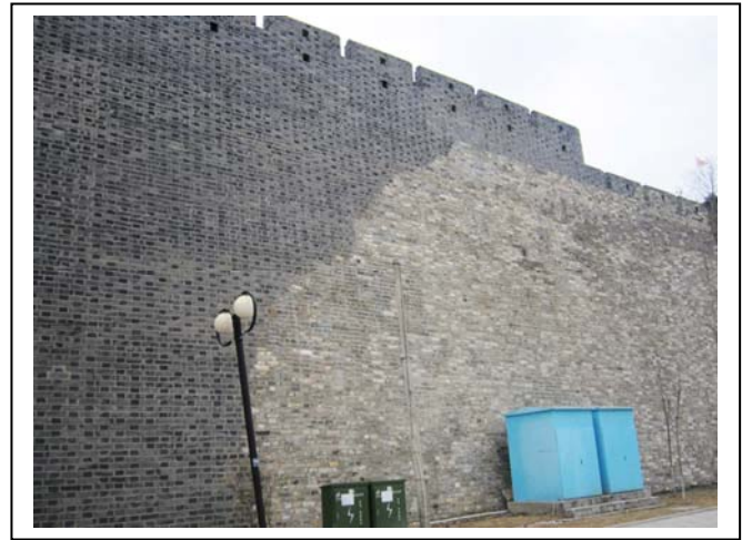
Fig.11 The trace of inter-face is very obvious