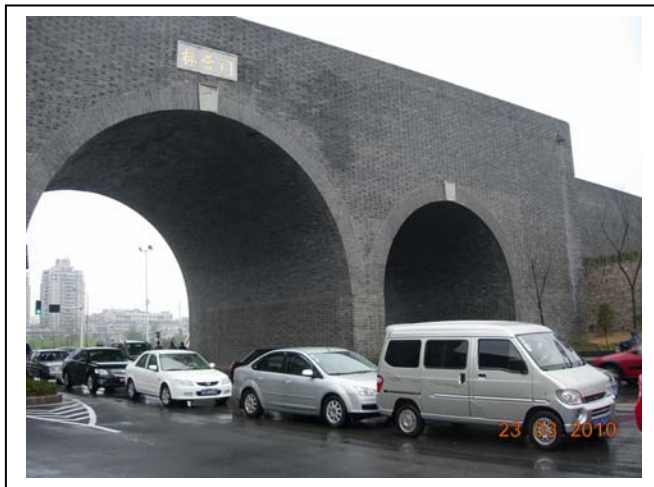
Fig.9 Reconstructed city wall cuts off the city's traffic