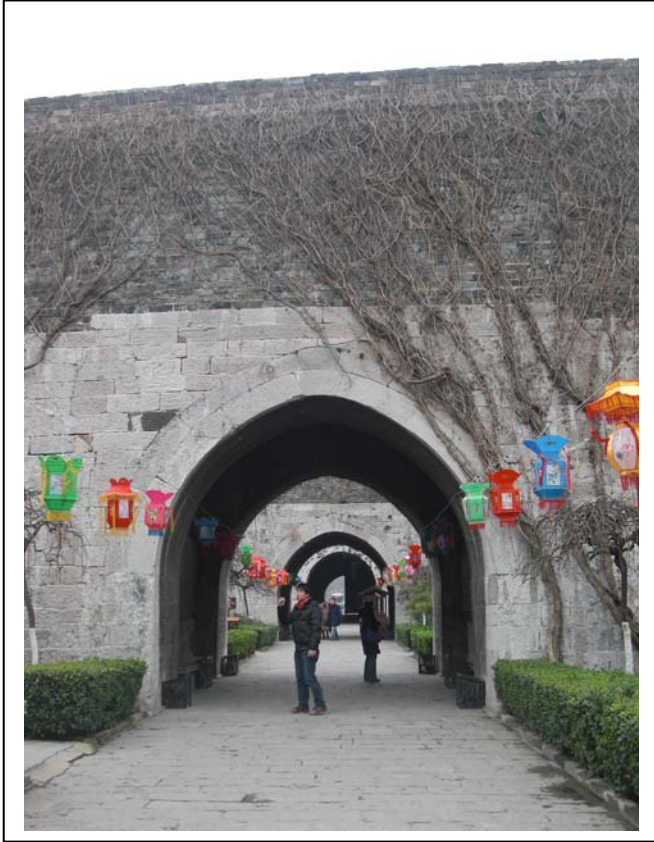
Fig.3 The city wall gates have excellent skills

So the ancient city wall forms the unique city characteristic of Nanjing, becomes a famous masterwork model in ancient city architecture of China. It has important research value in history, culture, political and military and so on.