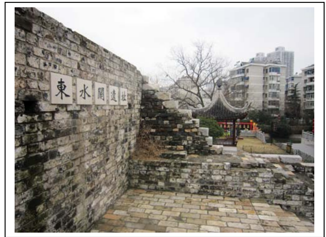
Fig.14 A large part of walls were completely destroyed

The most precious characteristic of cultural relics is its natural character. To protect cultural relic is to protect the whole existence process from its birth until to take some measures. From this process we can gain several information, that is, various values of its historical, cultural, scientific, emotional, and so on. So protection is not only to protect the cultural relics itself, but also to protect the whole necessary space environment around the cultural relics [14].