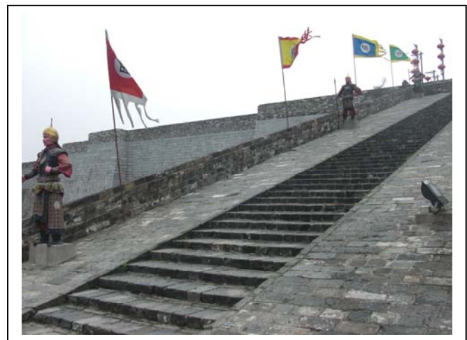
Fig.5 The city wall full of historical memory

Famous architect Wu Liangyong said:” A city writes its history everyday. Today’s new construction is tomorrow’s history. Future people see today just as today’s people see yesterday. Culture always continues and the city contains untapped quantities” [4]. An old house, an ancient town and even an old tree, they all just might be dilapidated antiques from an utilitarian point of view and possibly the obstacles to the development; however from a cultural vision, all of them contains rich and massive cultural values.