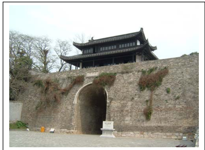
Fig.6 The ancient city wall formed the characteristic of Nanjing

Obviously, to protect the ancient historical and cultural relics is a beneficial thing. But the key point is if there is something wrong with the protection purpose and operation methods in protecting the ancient wall? Take a look at the several sections of the ancient walls which have been repaired, we see many problems coming along with the reconstruction and restoration.