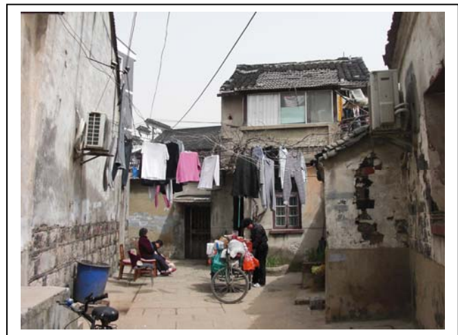
Fig.7 People who live under the city wall