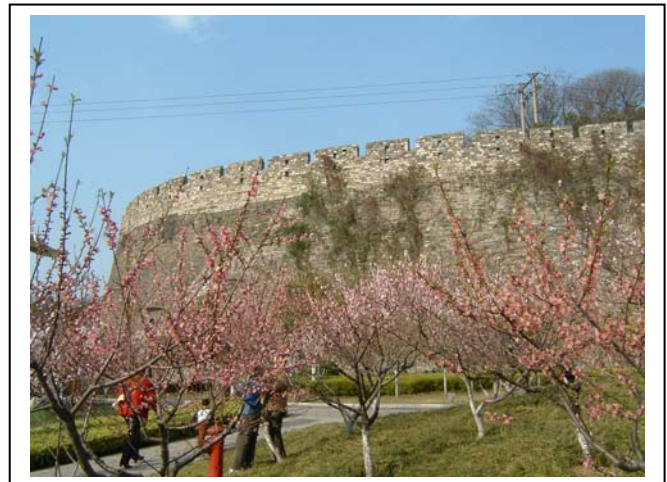
Fig.18 The city wall should build harmonious relation with surroundings