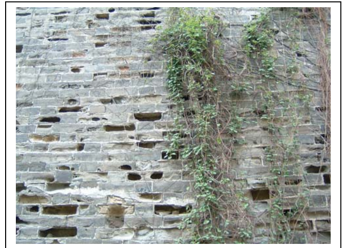
Fig.15 Many wall-bricks also had been damaged