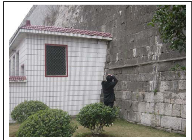
Fig.12 Buildings around the city wall are discordant