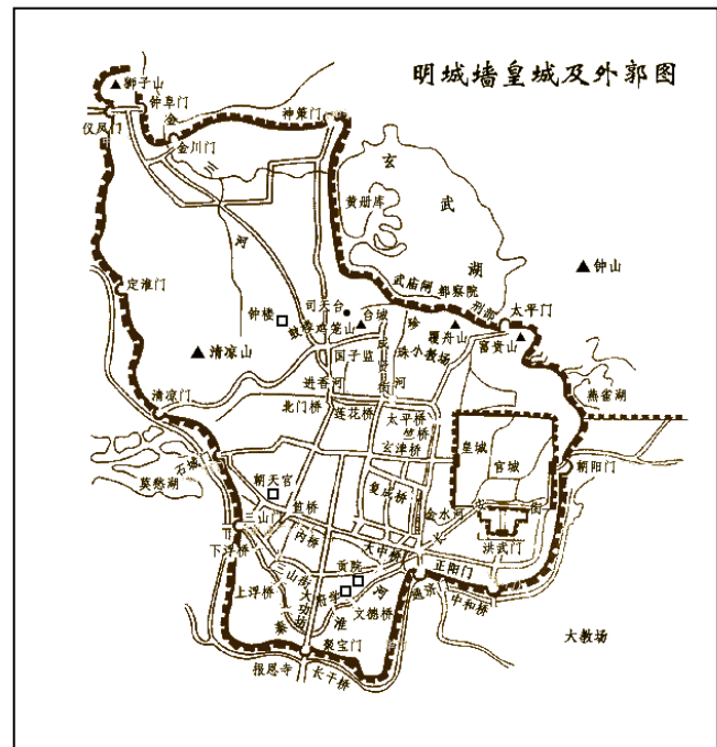
Fig.1 The layout of city wall around the capital

CHEN Rong. College of Landscape Architecture, Nanjing Forestry University. Lecturer, PHD. Engaged in teaching and researching of landscape planning, landscape architecture design. 159 Longpan Road, 210037, Nanjing (phone: 0086-159-5177-5666; fax:0086-25-8548-3026; e-mail: cr-nj@126.com)