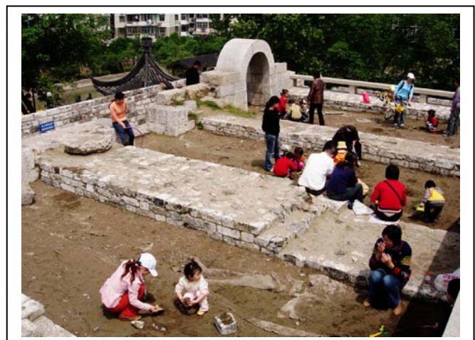
Fig.19 Combination of kids and the wall