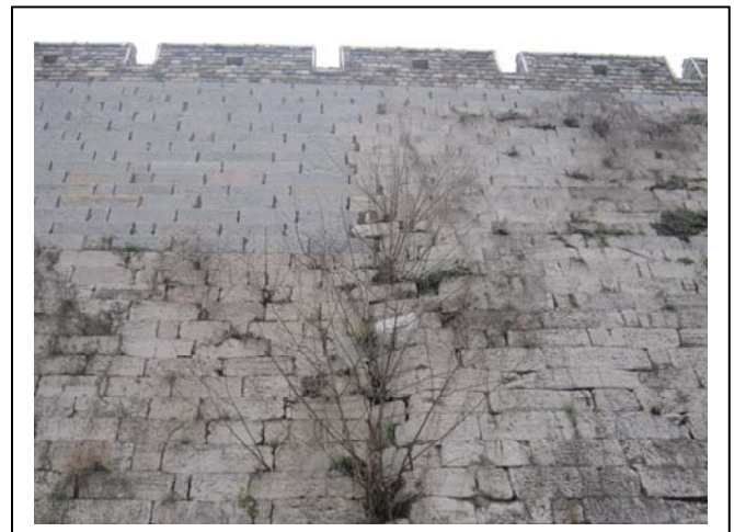
Fig.16 Roots of trees broke the city wall