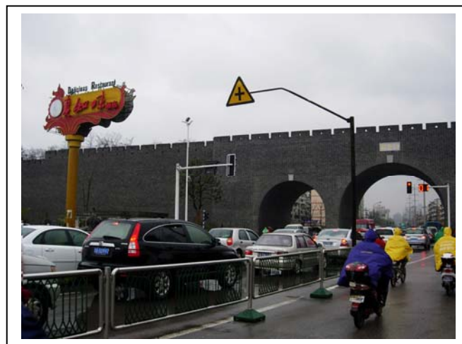
Fig.10 Road becomes a huge parking place