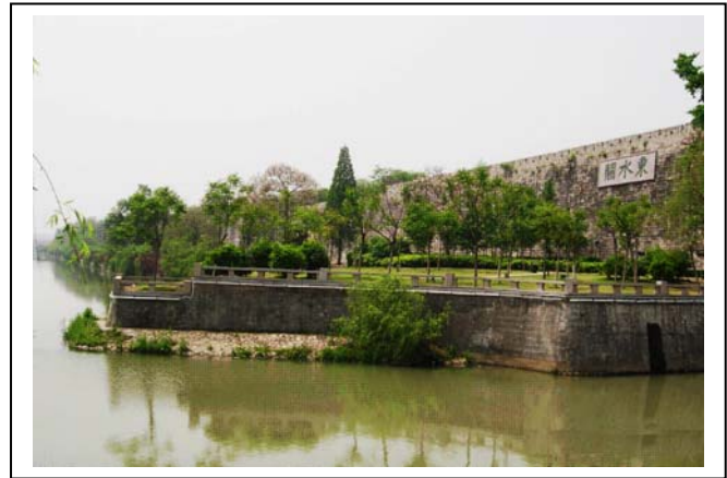
Fig.17 Sinuous Qinhuai River along the wall

As a result, a key point in the protection of the walls in Nanjing should not be neglected: they’d be blending into the lives of people completely. They should be designed for the surroundings and adapt to the natural process of landscape areas, and all of the above all stand on the cornerstone of a profound understanding of the nature [19]. The link between the walls and the people shouldn’t be ignored if we want the legacy applications to go smoothly. The walls should show the outside a new appearance which is in harmony with the natural process and the cultural activities rather than keep the modern society and the heritages isolated from each other. They should take the spirit of a particular place and significance of the times