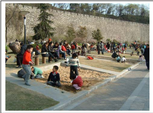
Fig.20 Let people's activity becomes a part of landscape of city wall

into consideration and also focus on the expression of cultural context (Fig.19, Fig.20).