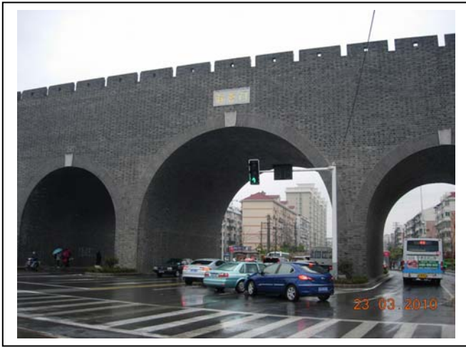
Fig.8 Reconnected city wall limited road space