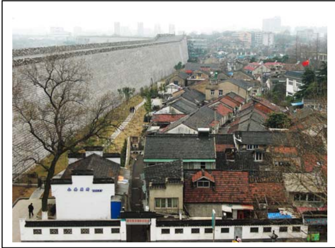
Fig.13 Overlook the old houses from the city wall

shall not exist in the near future (Fig.13). How to maintain the relationship between the city wall and people? How to continue historical culture which has existed for hundreds of years?