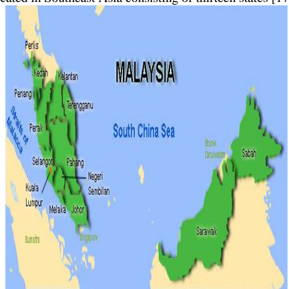
Figure 1 Geography of Malaysia

Malaysia is a country with two geographical regions, which one of them is the Peninsular Malaysia, and the second one is the East Malaysia or Sabah and Sarawak. It is located in Southeast Asia consisting of thirteen states [17].