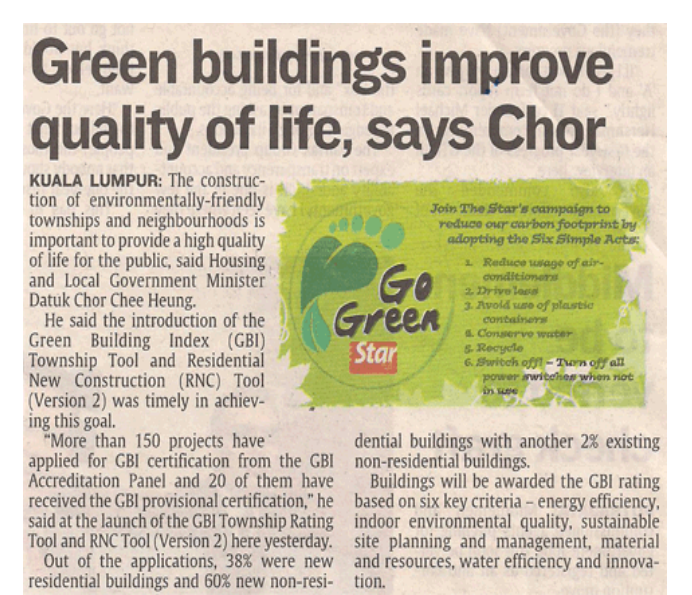
Figure 3: GBI improve quality of life

Malaysian experts embark to develop a local assessment tool in building level, which is called Green Building Index (GBI). The objective of development of GBI is to save energy, resources, recycle materials and harmonize the building with the Malaysia climate, traditions, culture and its environment as well as maintaining the capacity of the ecosystem at local and global levels [30].