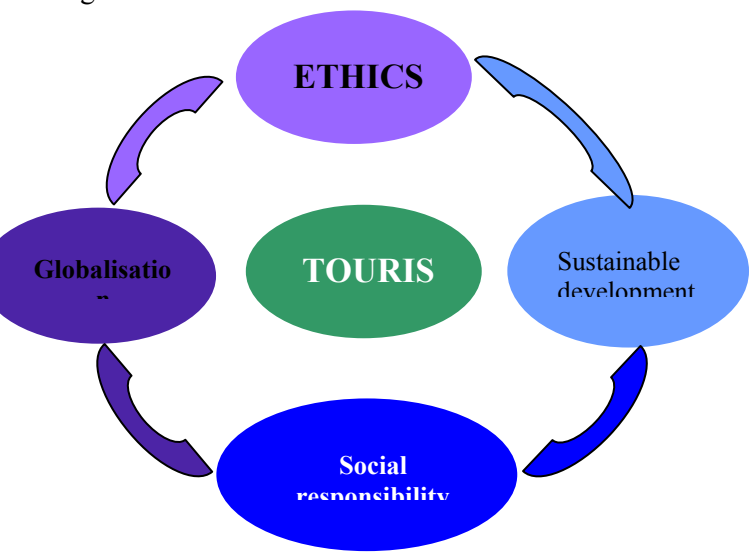
Fig. 2. Tourism interrelation with other areas

Under the conditions of the economic life globalisation, all the aspects regarding the social responsibility and the ethical problems become extremely important preoccupations of the tourist companies, especially from the perspective of the sustainable development, itself affected by the globalisation metamorphoses, undergoing a process of inter-conditioning. (fig.2)