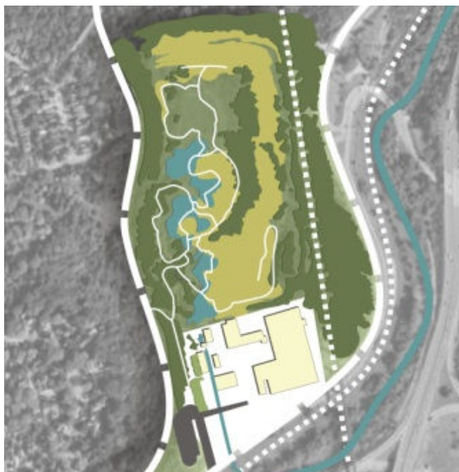
Figure 7 – Don Valley Brickworks Project Masterplan – Used by permission of Luís Loures, all rights reserved.

restoration and water quality improvement.