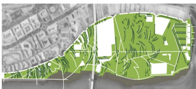
Figure 4 – Parque Tejo-Trancão Masterplan

Located at the oriental part of Lisbon, in an area marked by abandonment and environmental degradation at the confluence of two rivers from which it takes its name, “Parque do Tejo e do Trancão” is one of the most emblematic examples of postindustrial landscape transformation projects realized in Portugal.