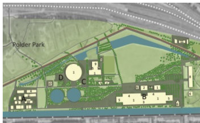
Figures 5 – Westergasfabriek Masterplan

Additionally, “ by representing such a clear example of the passage from conceptual design ideas to implemented built work, it stimulates both professional and public dialogue concerning the range of possibilities that may exist for such sites in the future around the world ” [31].