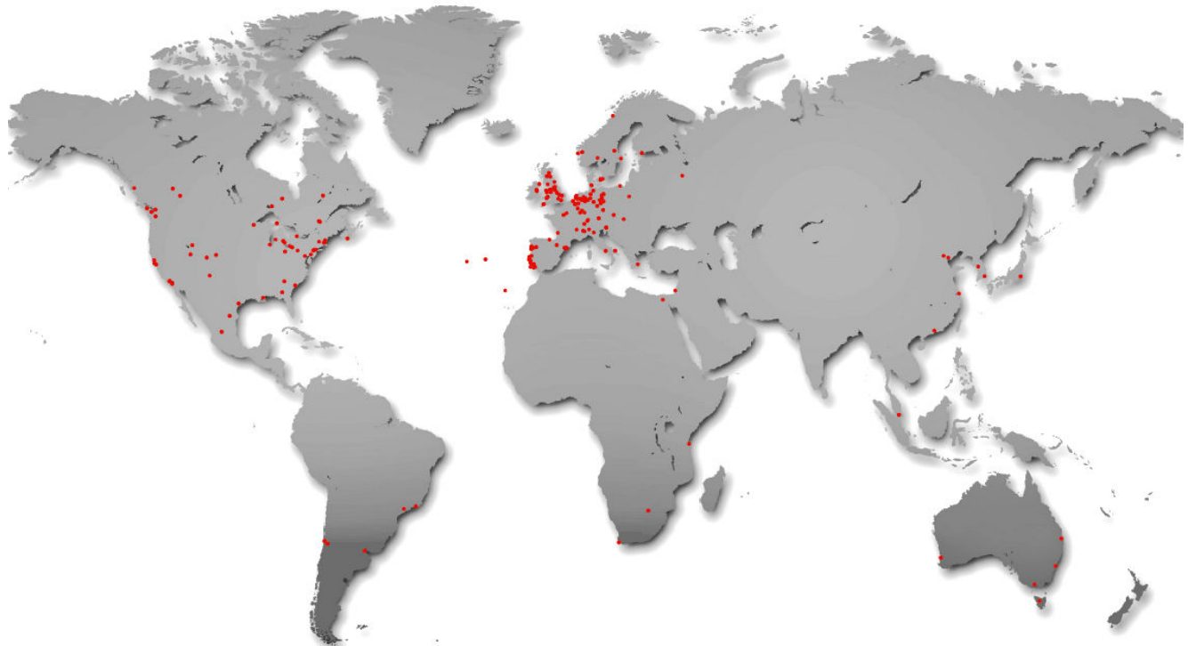
Figure 1 – Geographic distribution of the identified case studies Note: Case studies with similar location were represented by a single red dot.

Considering the objective to collect, analyze and organize as much information about postindustrial land transformation projects, as was possible within the boundaries set by schedule, the lack of common theory regarding postindustrial redevelopment, and the abovementioned premise concerning the importance of practice in theory [23], 346 postindustrial land transformation case studies (Figure 1), located all over the world, were identified throughout the application of several information gathering techniques (literature and database review, project analysis, and informal interviews and meetings both at the academic and practical levels).