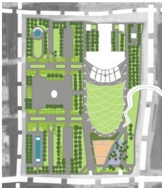
Figure 8 – Millennium Park Project Masterplan

The used design strategy was based in a strong interdisciplinary approach in which architecture, landscape and art were viewed as complementary elements. In this regard, the proposed design considered the development of a multifunctional cultural venue composed by several installations, created by well-known artists and designers. In fact the Millennium Park represents an unprecedented combination of architecture, art, and landscape design in a single public project.