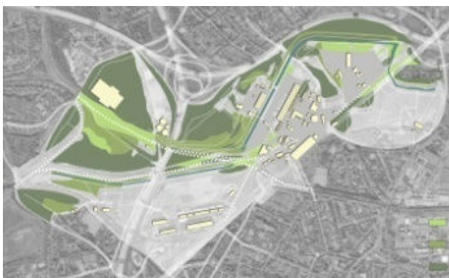
Figure 3 – Duisburg Nord Project Masterplan

Budget: 15.300.000 € - budget which does not include interventions in buildings, cleanup and the construction of the underground sewer.