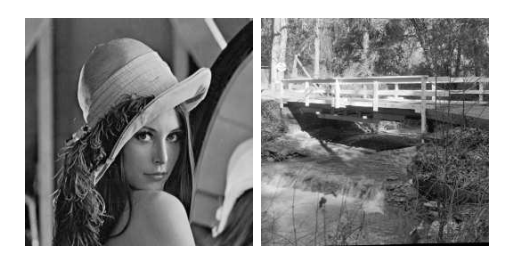
Figure 2: Lena, Bridge (256x256)