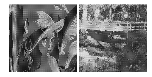
Figure 5: GA with GLA: Lena, Bridge