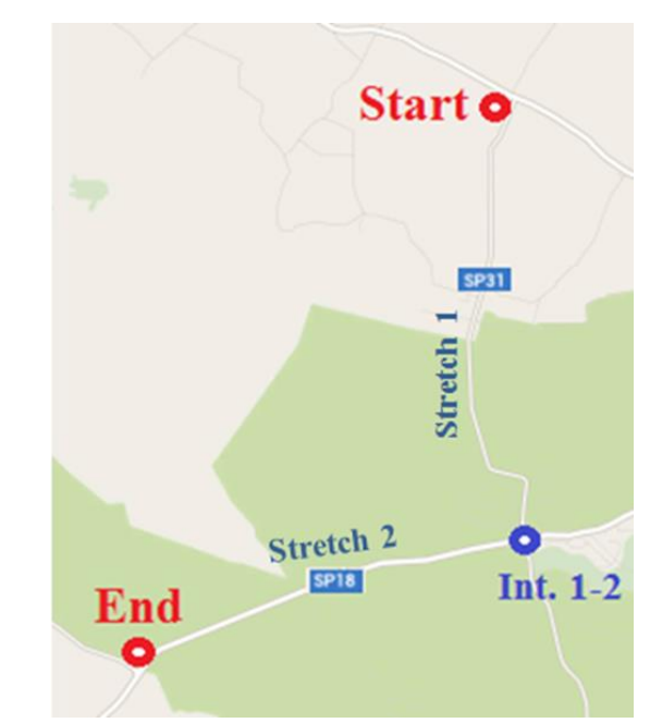
Fig. 1 example of a driving test schedule for all users belonging to the sample

Fig. 2 layout of the test driving routes