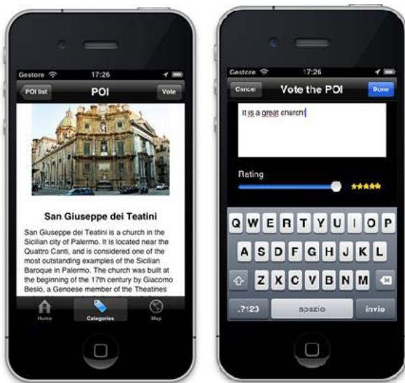
Figure 2 : Page of the point of interest

4. By clicking on each POI in the map students access a specific page related to the POI to get further information retrieved from DBpedia. The layout of the page is chosen accordingly with the students' preferred media format and the type of information available for the selected POI (photo, video, text). Finally, by clicking on the Vote button, the user can vote and comment the POI (see Figure 2).