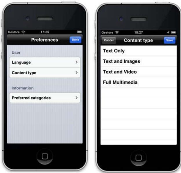
Figure 1 : Setting User preferences

4. By clicking on each POI in the map students access a specific page related to the POI to get further information retrieved from DBpedia. The layout of the page is chosen accordingly with the students' preferred media format and the type of information available for the selected POI (photo, video, text). Finally, by clicking on the Vote button, the user can vote and comment the POI (see Figure 2).