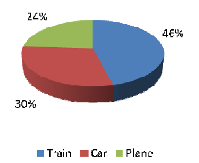
Fig.2 Tourist distribution according to the means of transport used

Statistics revealed that 59,6% people who responded to the questionnaire were women (149) and 40,4% were men – the data indicates that women are more interested in coming to Timişoara. The means of transport used by tourists are the train (46%), the car (30%) and the plane (24%). Thus, the train remains more accessible to tourists, probably for money reasons (fig.2).