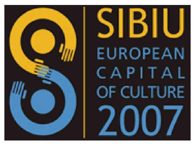
Fig.1. The official logo of the event

taking into account the historical and multicultural traditions of the county). Financially speaking, the impact was significant as well, registering important increases in different domains: hotelier - 80%, tour-operator - 76%, transport - 75%, industry - 49%. A different category of positive impact was the media one<sup>2</sup>.