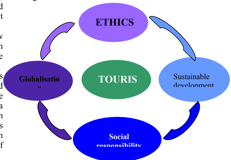
Fig. 2. Tourism interrelation with other areas

Under the conditions of the economic life globalisation, all the aspects regarding the social responsibility and the ethical problems become extremely important preoccupations of the tourist companies, especially from the perspective of the sustainable development, itself affected by the globalisation metamorphoses, undergoing a process of inter-conditioning. (fig.2)