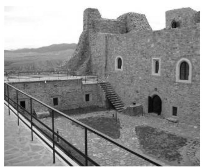
Fig. 4 Neamtului Fortress - the inner environmental aspects

Maybe none of the analyzed fortresses not emphasize the communion between the environmental and historical elements as the Neamtului Fortress. If in the case of other analised fortresses one could dissociate the natural and the