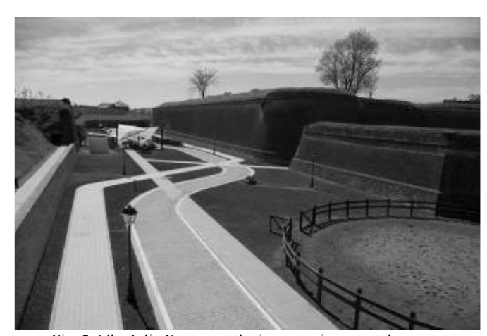
Fig. 2 Alba Iulia Fortress – the inner environmental aspects

Alba Iulia Fortress is Vauban-like fortress which articulates in the local space the star shape of the vigurous walls and the morphological step of the hills descending from Trascău mountains and the plains middle Mures valley. The fortress was built on the site of ancient settlements, on the second terrace of Mures river. Is undoubtedly the most