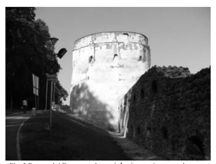
Fig. 3 Brasovului Fortress – the peripherian environmental aspects

important natural objectives (Timisului Mountains, Prahova Valley) and the absence of unified architectural character mark the present perception. Yet, the transport infrastructure, the accommodation facilities, the general level of the area's