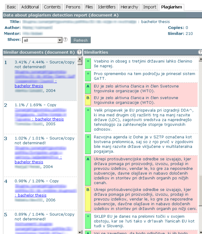
Fig. 4: Detailed view on document similarity report

documents at the top. This list can be filtered, displaying only copies or only source documents (originals). Clicking on any title in this list selects the “Document B”. This fills the list on the right, showing all similar content in the order, as it appears in the document A. Content can be written exactly the same or slightly differently. Different contents are marked with read background and both versions are displayed for comparison.