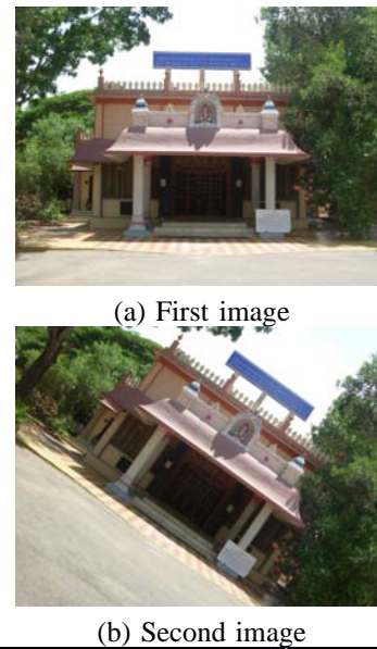
Fig. 2. Temple image

2) Experiment on Temple image: The input images are fig.2 (a) and fig. 2 (b), the mosaiced image is fig. 5. The black region indicates the region where no mapping is done. This is considerably a large area due to the fact that the input images respect the same visual scene. Comparing 5 and 2 (c) in the mosaiced image. In the implementation of the first algorithm we have taken the first image as the base image, therefore we find that the Mosaiced image is also based on the first image. Hence the temple is not tilted in the Mosaiced image. But here the image is tilted as the second image is