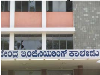
(b) Second image