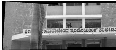
Fig. 6. Mosaiced entrance image