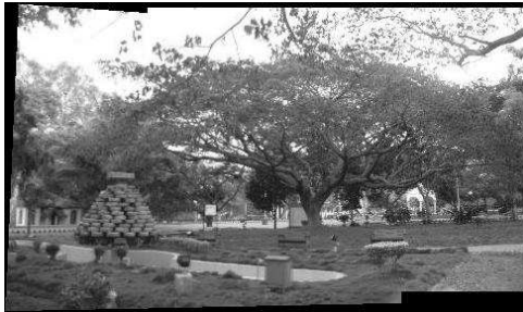
Fig. 4. Mosaiced fountain image