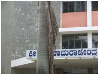
(a) First image