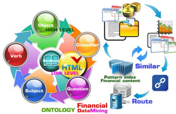
Figure 1. show pattern index of financial content

using pattern index of financial content. We use two level as follow Financial keyword and and Command Tag.