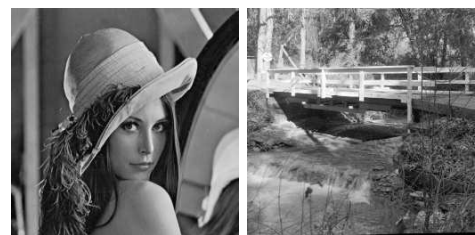
Figure 2: Lena, Bridge (256x256)