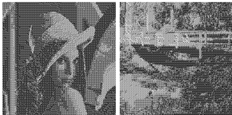
Figure 3: GA with roulette: Lena, Bridge

After we apply the series of experiments for SGA and OGA we get the images in compressed forms. The images Figures [3 – 7].