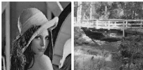
Figure 4: GA with tournament+elite: Lena, Bridge