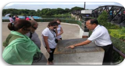
Fig.1 Guides explain the history in the tourism

The information above is why guides should approach to tourism awareness to complement the tourist attraction that still looks natural and cultural history. Visitors should have been filled in the knowledge that not to break the rules and do not create any problems. Guides should find a way to build understanding, notice and act as a good example for tourists to see. Find a way to raise awareness for tourists to travel to cooperate together in the right way. For his part, willing to cooperate with guide and tourist visits to every question that should follow. They should communicate to travelers to see the uniqueness of Thailand. The practice of guiding in the role of preservation and creation of awareness for tourists to realize before, during and after visit tourist attraction by focusing on the tour is ideal for visitors to see.